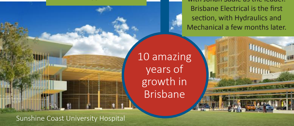
Sunshine Coast University Hospital